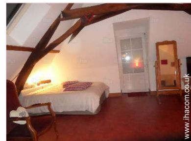
The guest room