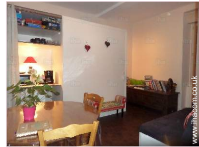
Facilities exclusive to