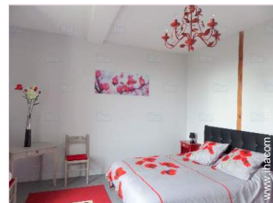
The guest room