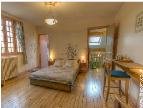
The guest room