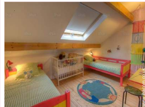
The guest room