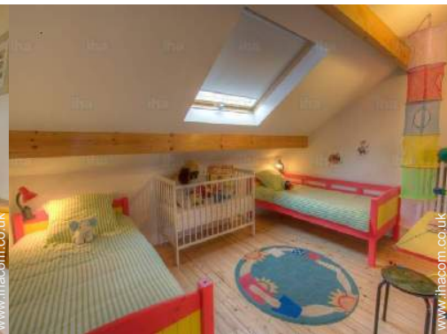
The guest room