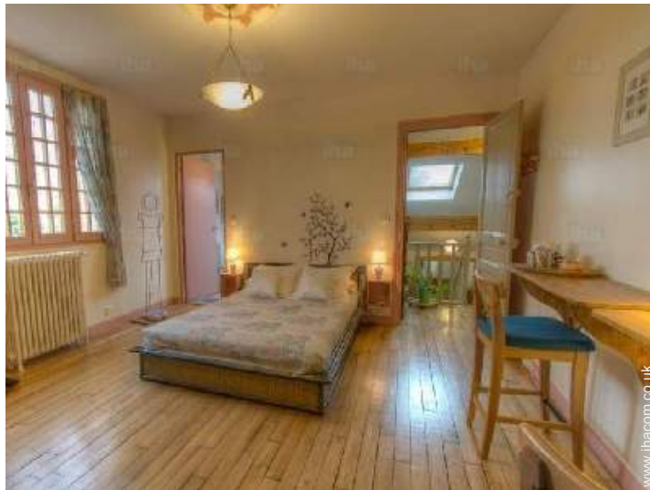
The guest room