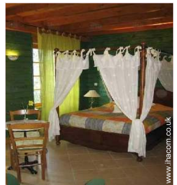
The guest room

Ski slopes 12.5mi. Ski lifts 12.5mi. Ice skating rink 18.5mi. Heated swimming pool 6mi. Public swimming pool 6mi. Public tennis court 1.25mi. 18 hole golf course 15.5mi. Waterfall 4.5mi. Cliff 3mi. River 0.3mi. Stretch of water 4.5mi. Lake 12.5mi. Forest 165' Mountain range 0.62mi. Via ferrata-alpinism 12.5mi.