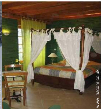
The guest room