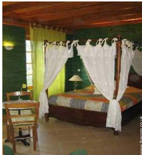
The guest room