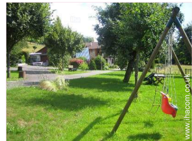
Outside at the guests disposal