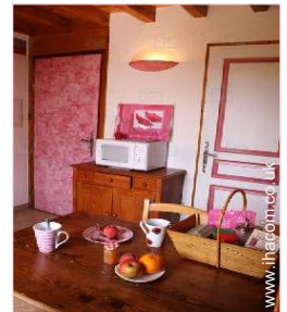
Interior layout at guests disposal