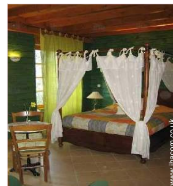
The guest room