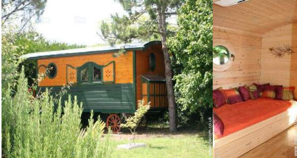
The guest room