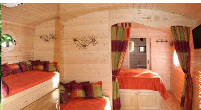
The guest room