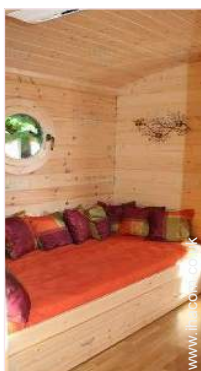
The guest room