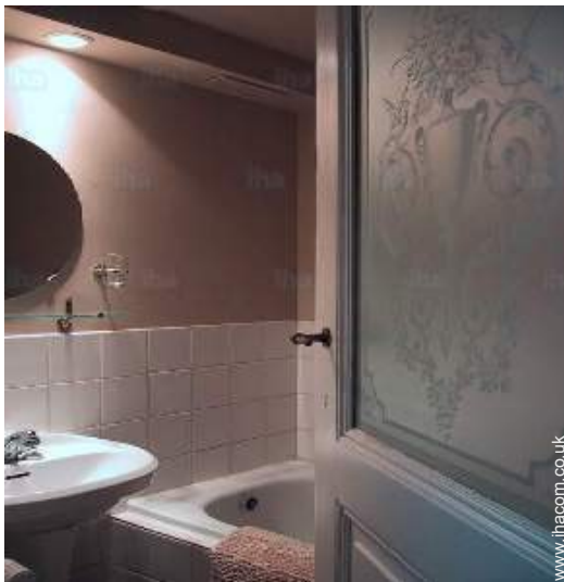
Interior comforts at guests disposal