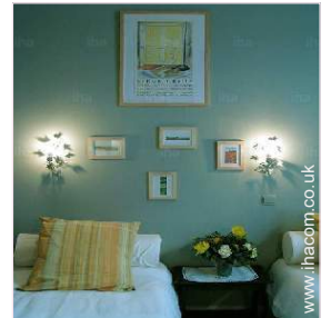
The guest room

Terrace 160 Sq.ft., garden table(s), 6 garden seat(s), parasol, 4 chaise(s) longue(s)