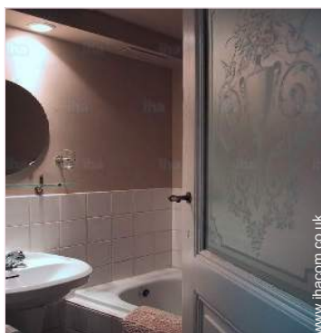
Interior comforts at guests disposal