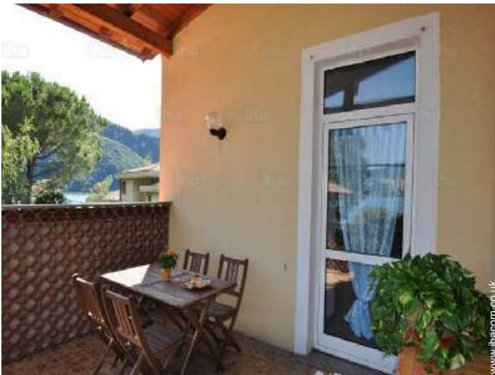
Outside at the guests disposal