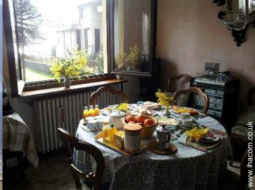
Interior comforts at guests disposal