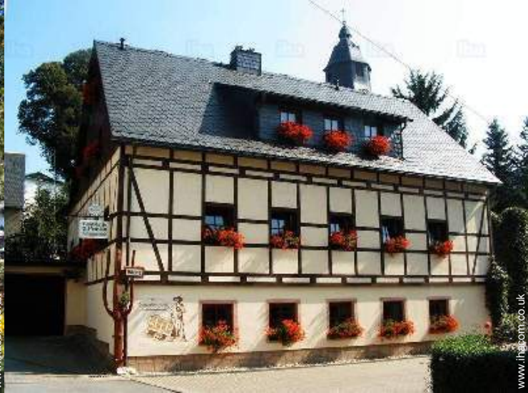
Luxury Tudor style house