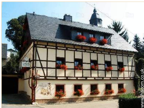
Luxury Tudor style house