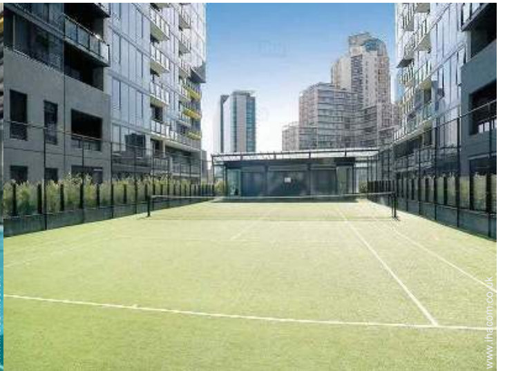
Tennis - synthetic surface