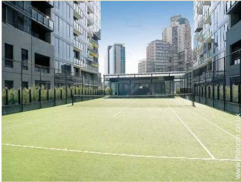
Tennis - synthetic surface