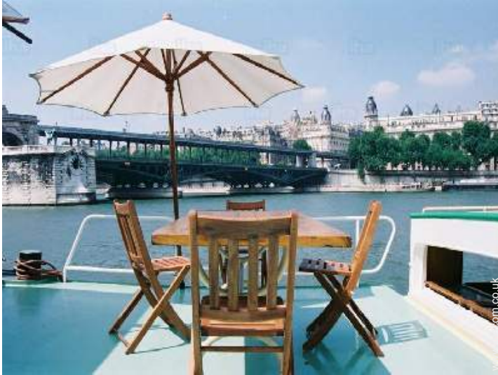
view over the river