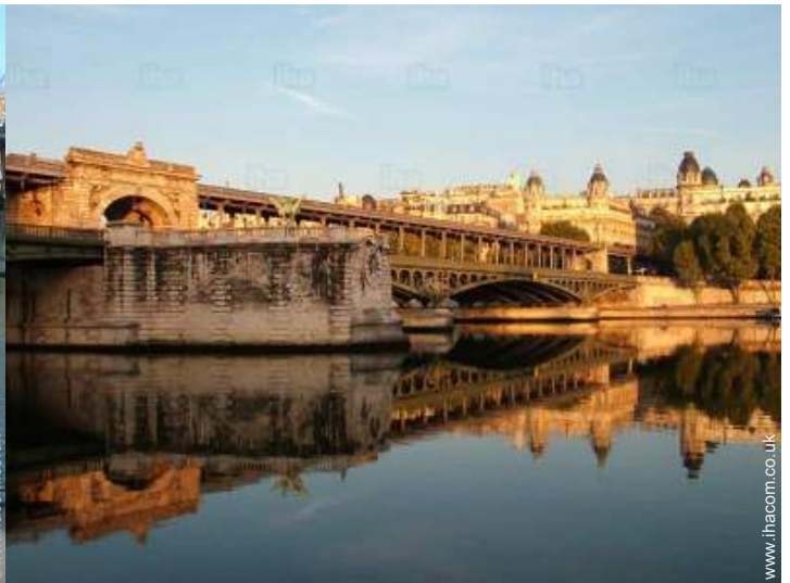
view over the river