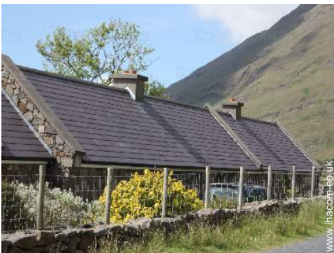
Charming Stone-Built House