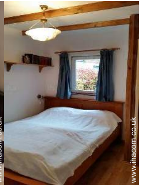
Sleeps - bed(s)