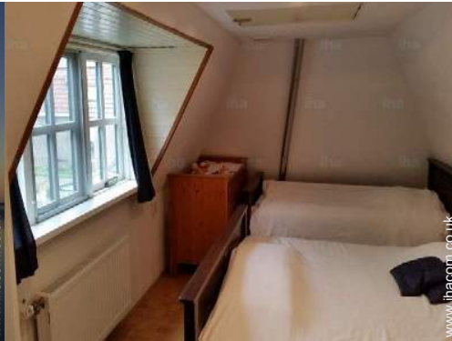
Sleeps - bed(s)