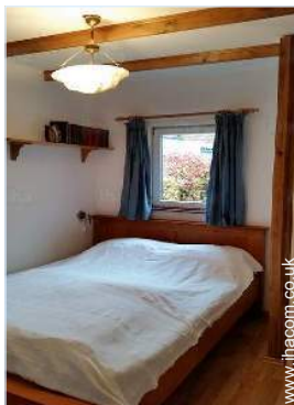
Sleeps - bed(s)