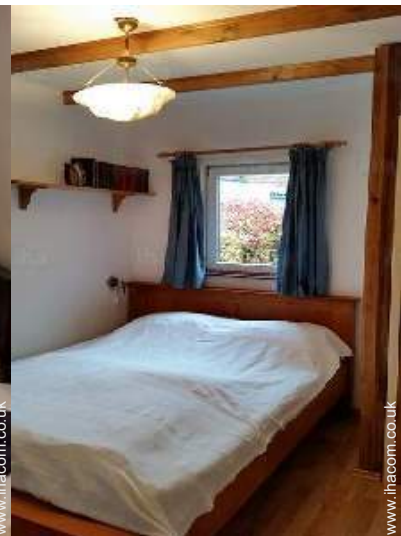
Sleeps - bed(s)