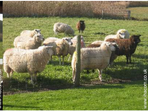
view from the house