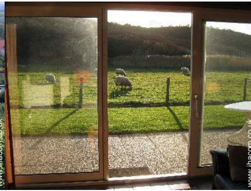
view from the house