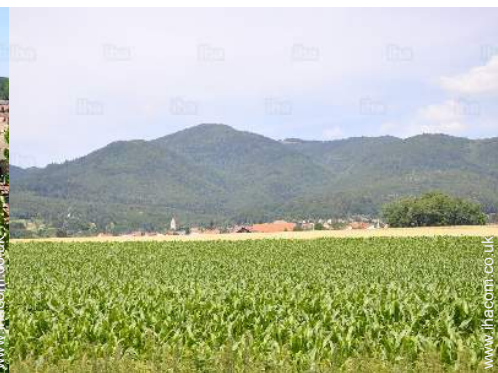
view over the mountain