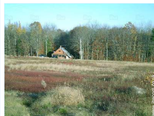
view over the countryside

Breadshop 9mi. Local shops 9mi. Supermarket 9mi. High class retailers 25mi. Hairdressing salon 3mi. Post office 3mi. Bank 9mi. Cash point 9mi. Chemist 25mi. Doctor 25mi. Hospital 25mi.