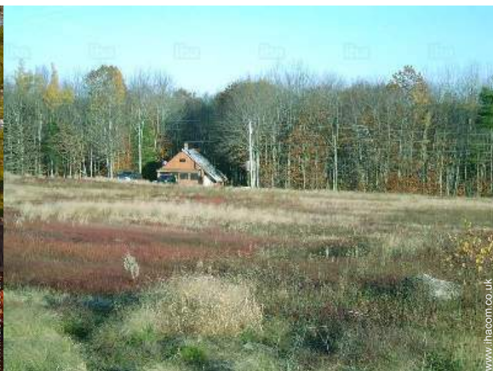
view over the countryside