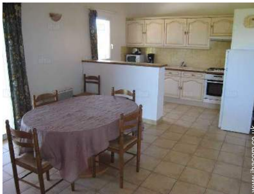
Guest facilities and furnishings