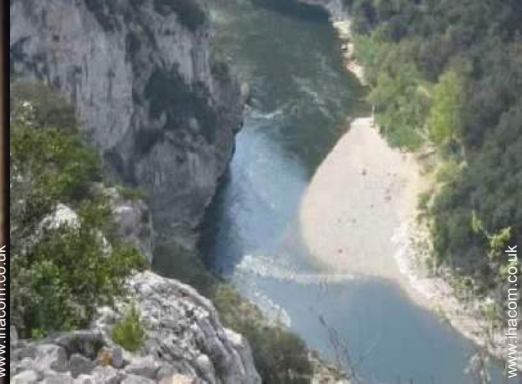
mountain pursuits nearby