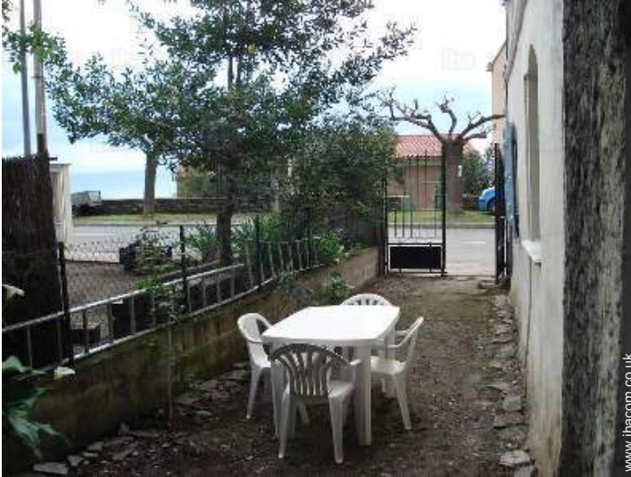
garden seated area