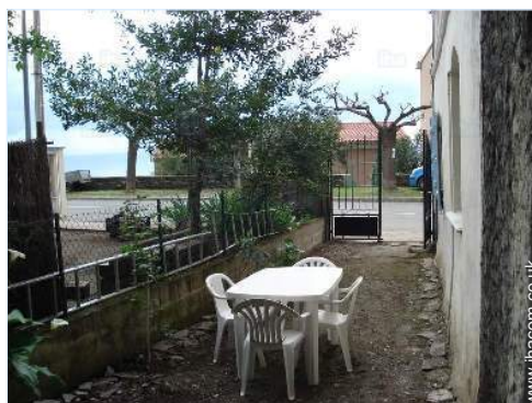
garden seated area