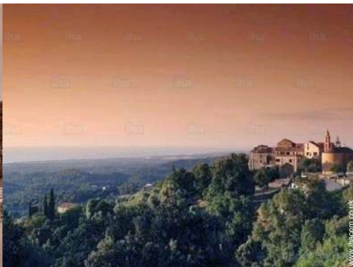
view of the village