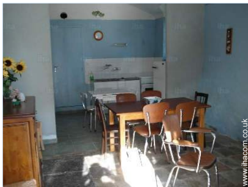
large american style kitchen