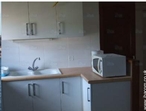
Equipment at the guest's disposal