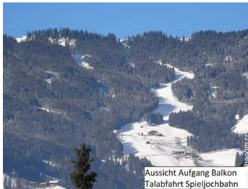
Aussicht Aufgang Balkon Talabfahrt Spieljochbahn