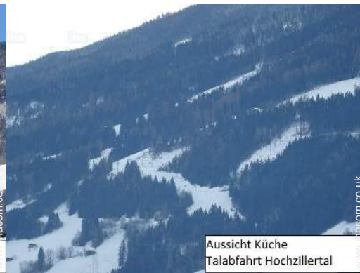
Aussicht Küche Talabfahrt Hochzillertal