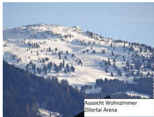
Aussicht Wohnzimmer Zillertal Arena