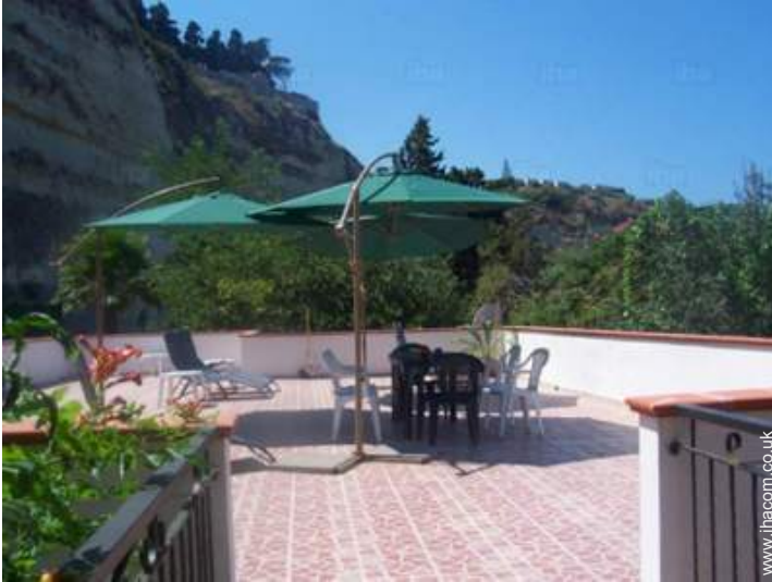
view from the roof terrace