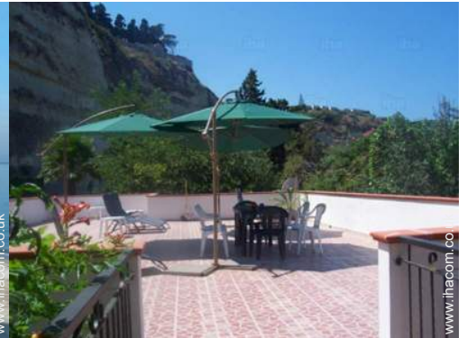
view from the roof terrace