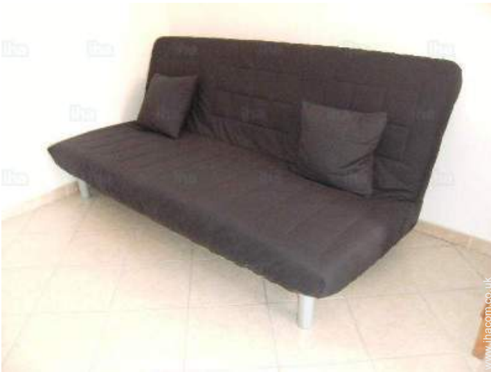
sofa bed(s) 2 pers