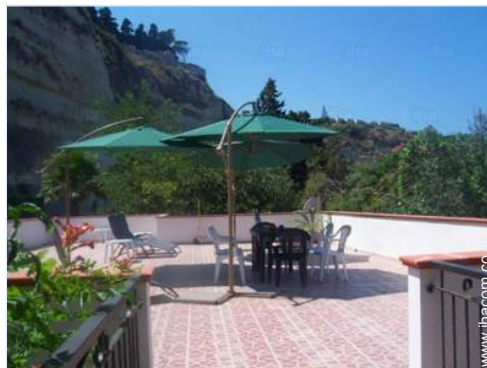
view from the roof terrace

Children welcome Non smoking rental, mobile telephone network coverage Water : hot/cold Local voltage supply : 220-240V / 50Hz Electricity supply : mains