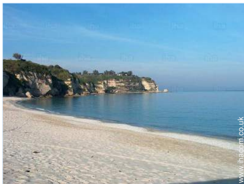
direct access to the beach