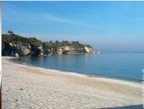
direct access to the beach