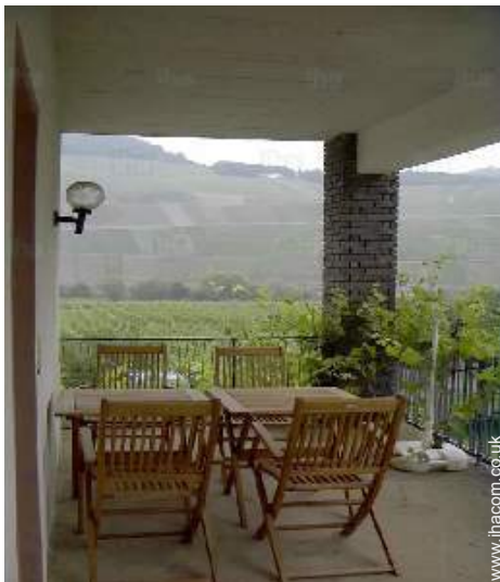
view from the balcony