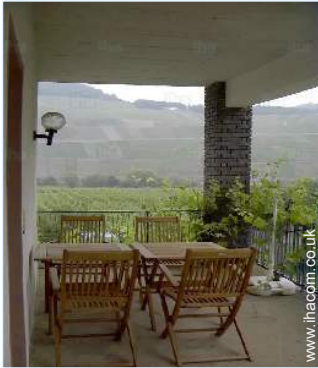
view from the balcony