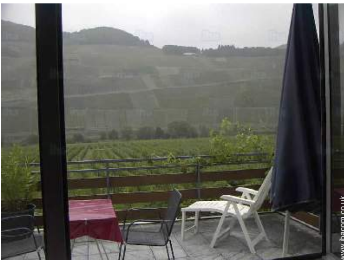
view from the balcony