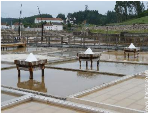
leisure pursuits nearby