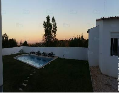
view of the sunset