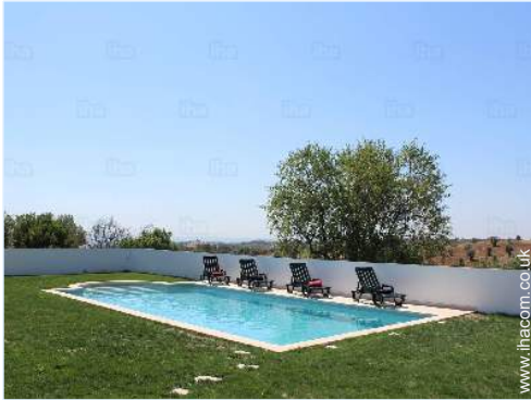
Rectangular swimming pool