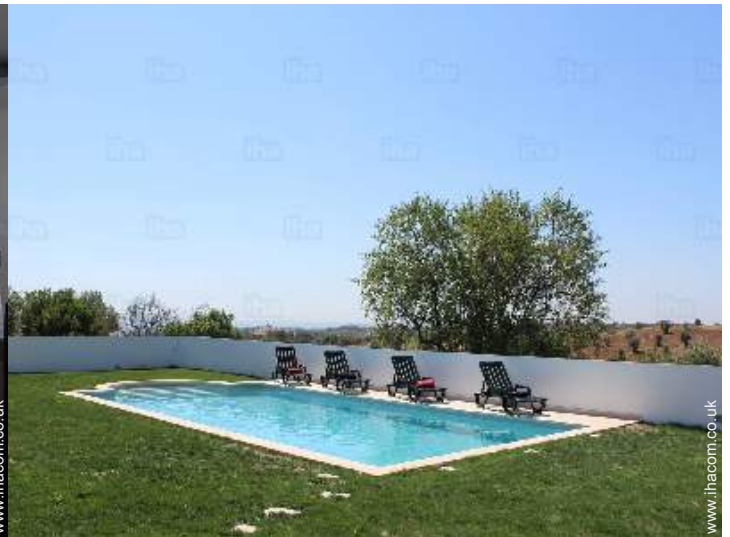
Rectangular swimming pool