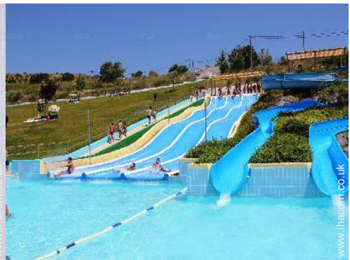
leisure pursuits nearby