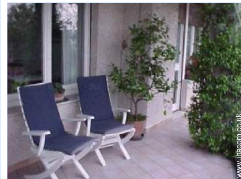
view from the covered terrace

Village centre 0.62mi. Boat rental 0.62mi. Breadshop 0.62mi. Supermarket 0.62mi. Post office 0.62mi. Bank 0.62mi. Chemist 0.62mi. Hospital 6mi. Dispensing clinic 0.62mi.