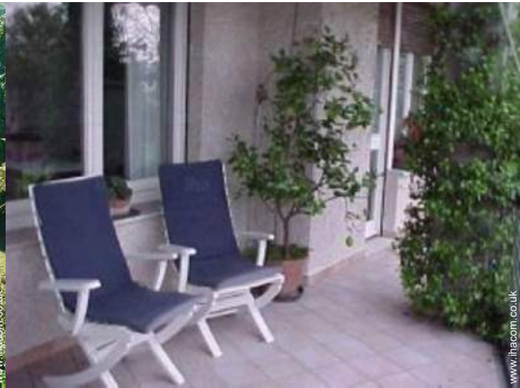
view from the covered terrace