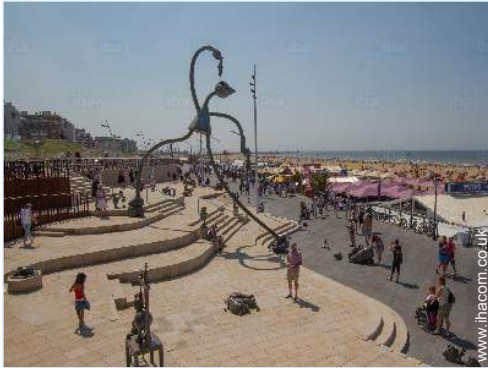
direct access to the beach