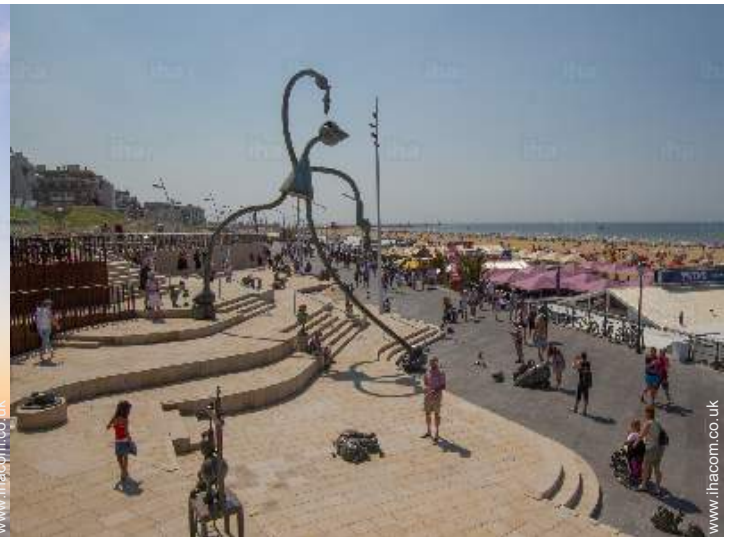
direct access to the beach