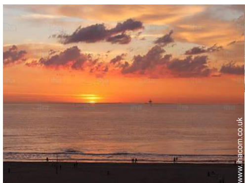
view of the sunset