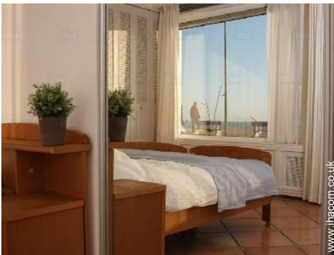
view from the bedroom