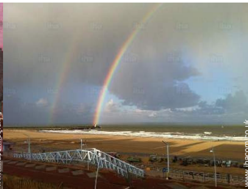
view over the sea