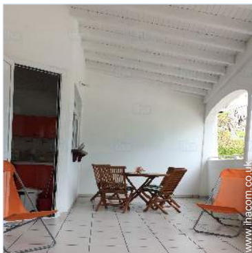
view from the covered terrace