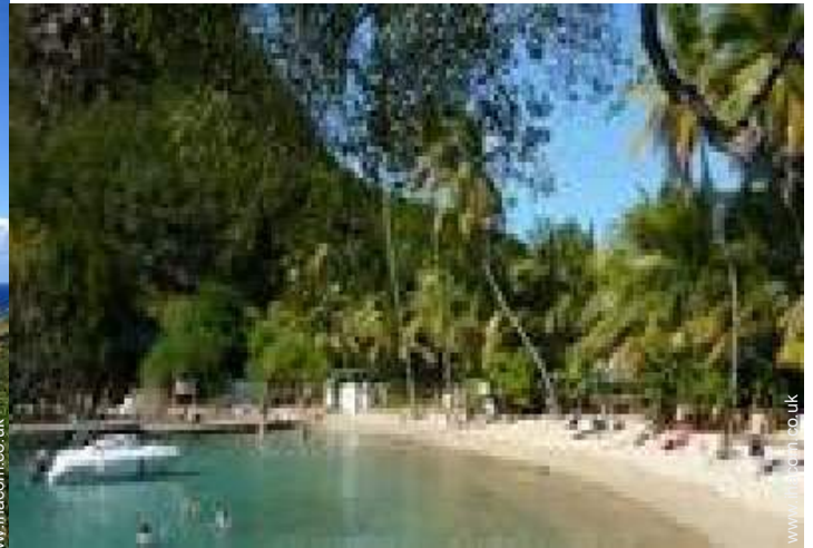
leisure pursuits nearby