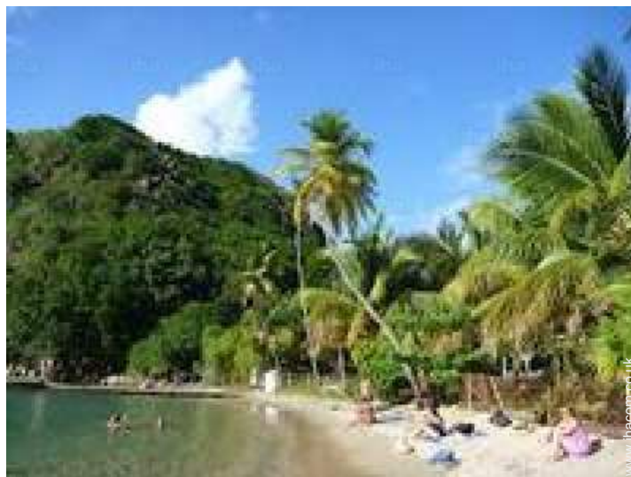
leisure pursuits nearby