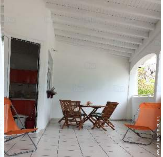
view from the covered terrace