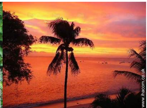
view of the sunset