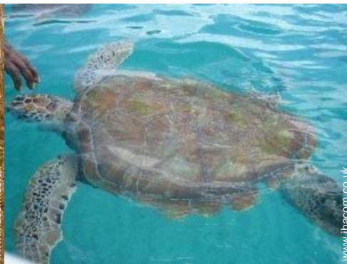
leisure pursuits nearby