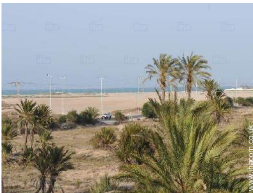
view from the roof terrace