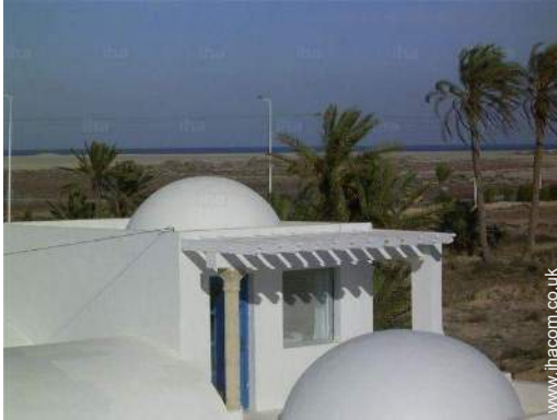
view from the roof terrace