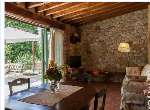
view from the dining-room