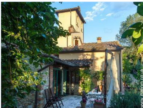
view from the veranda