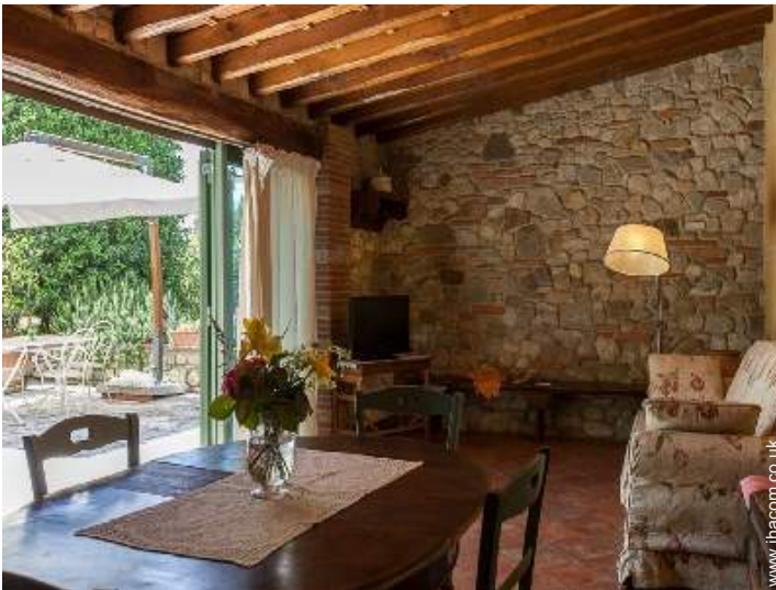
view from the dining-room