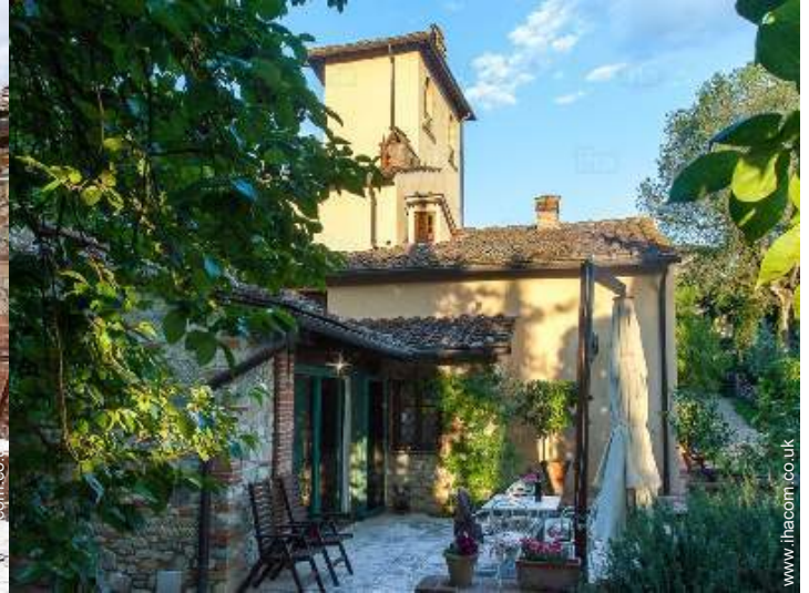
view from the veranda