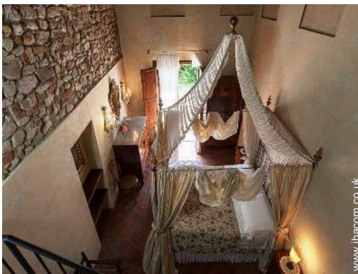
view from the mezzanine