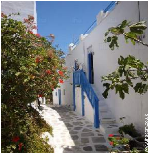
Cycladic style House