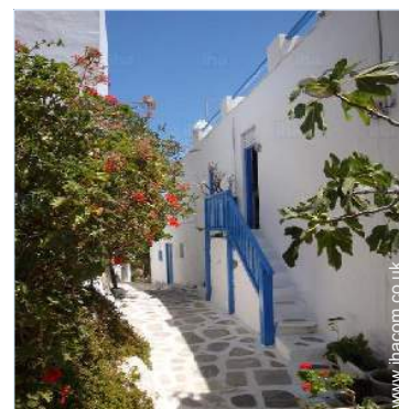
Cycladic style House