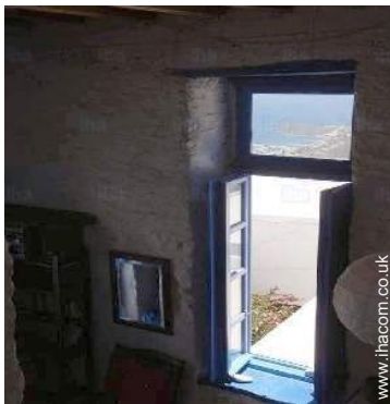
view from the mezzanine