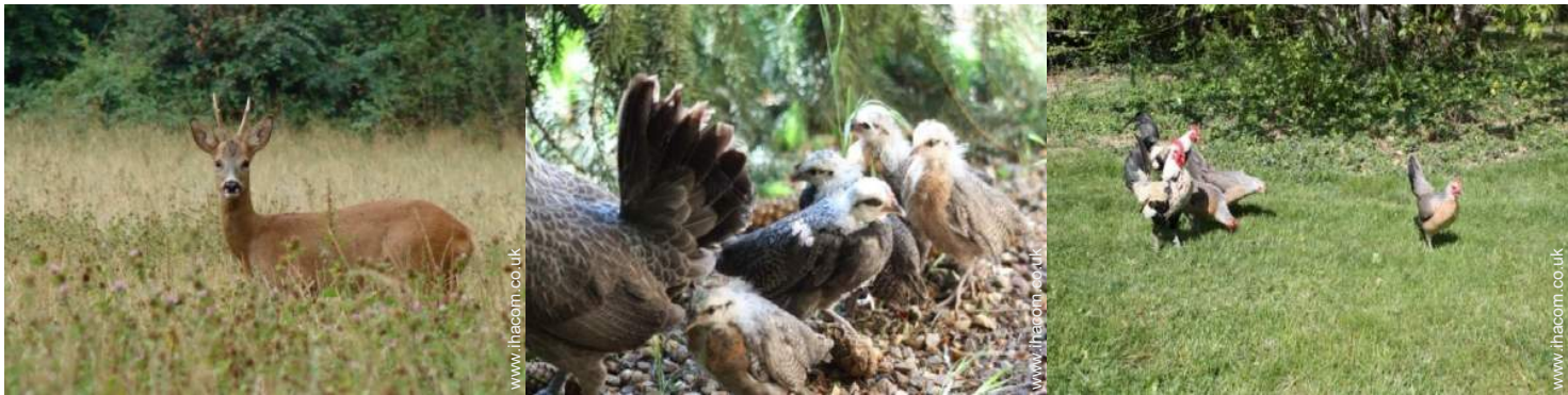
view over the countryside