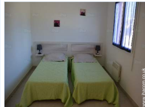
twin beds (standard)