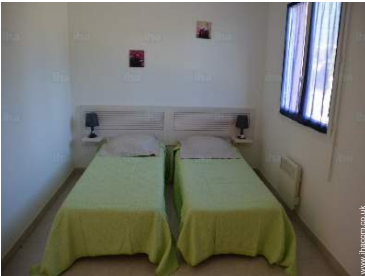
twin beds (standard)