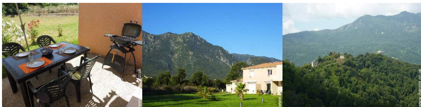
garden seated area