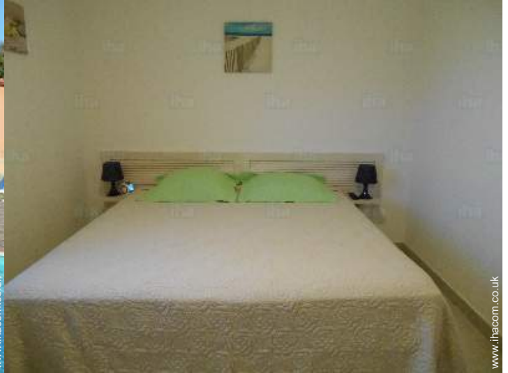
super king-size bed(s)