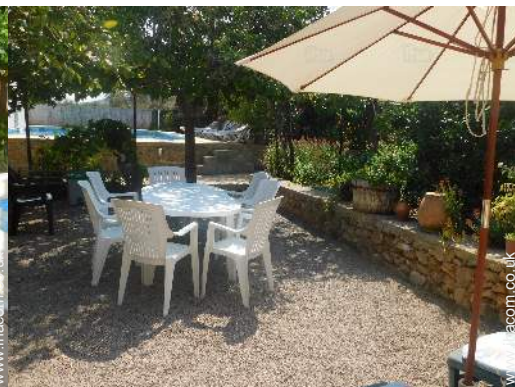
view from the terrace