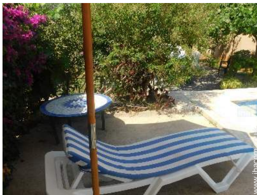
view from the swimming pool