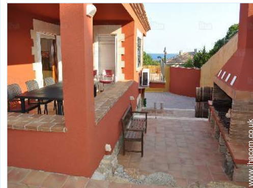
view from the patio