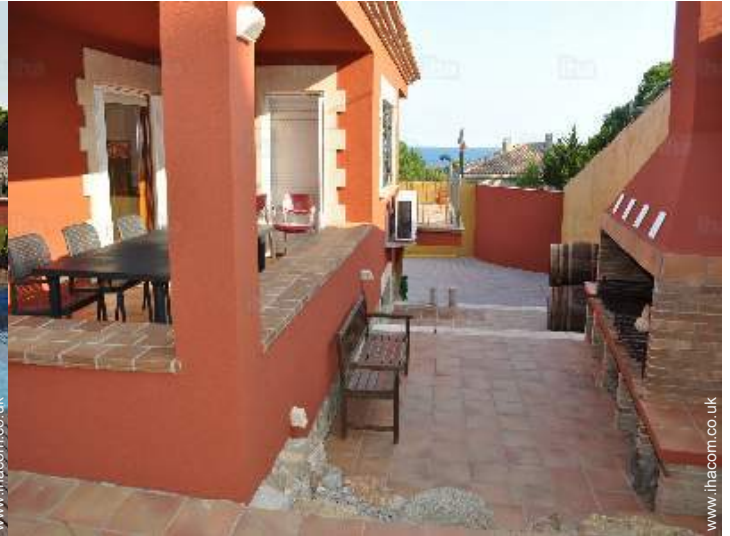
view from the patio