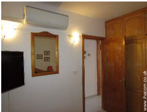
fully air conditioned