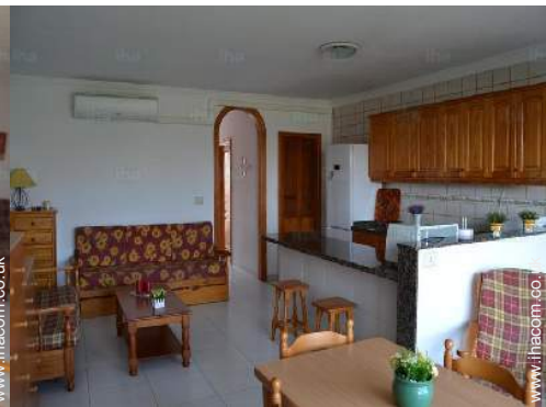
sofa bed(s) 2 pers