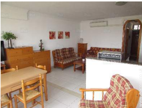
fully air conditioned