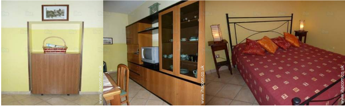
Sleeps - bed(s)