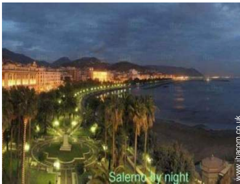
Salerno by night City