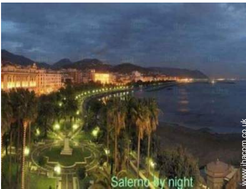
Salerno by night City