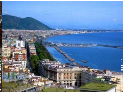
view of the town