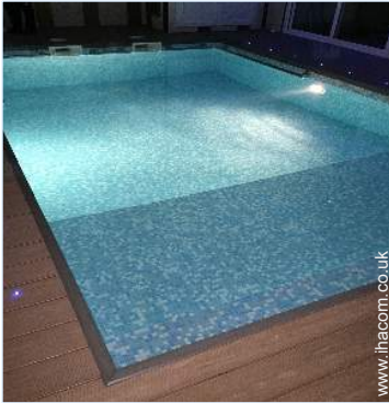
Inside swimming pool