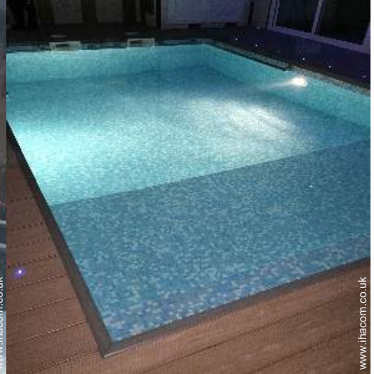
Inside swimming pool