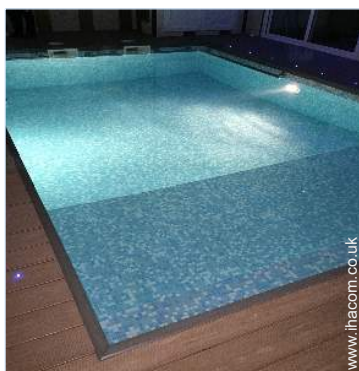
Inside swimming pool