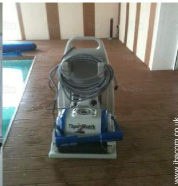
Inside swimming pool