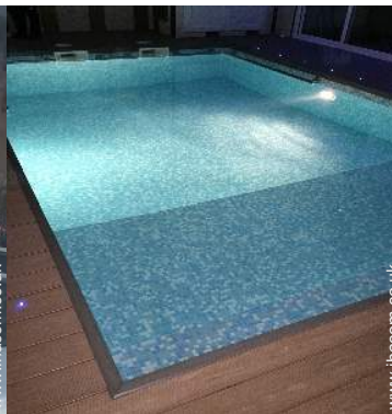
Inside swimming pool