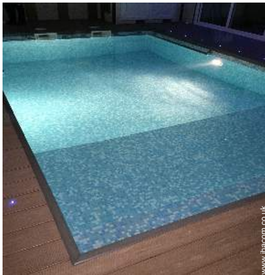
Inside swimming pool