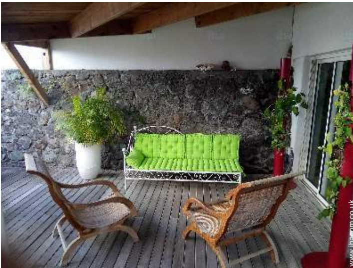
Equipment at the guest's disposal