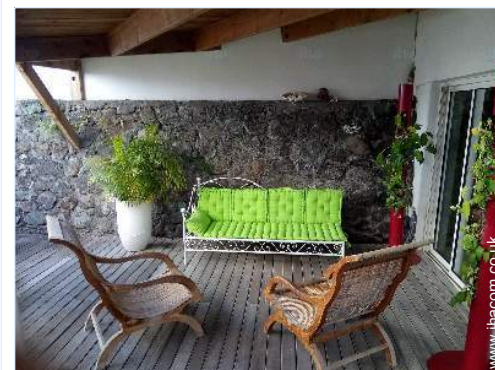
Equipment at the guest's disposal