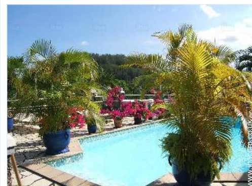
shared swimming pool