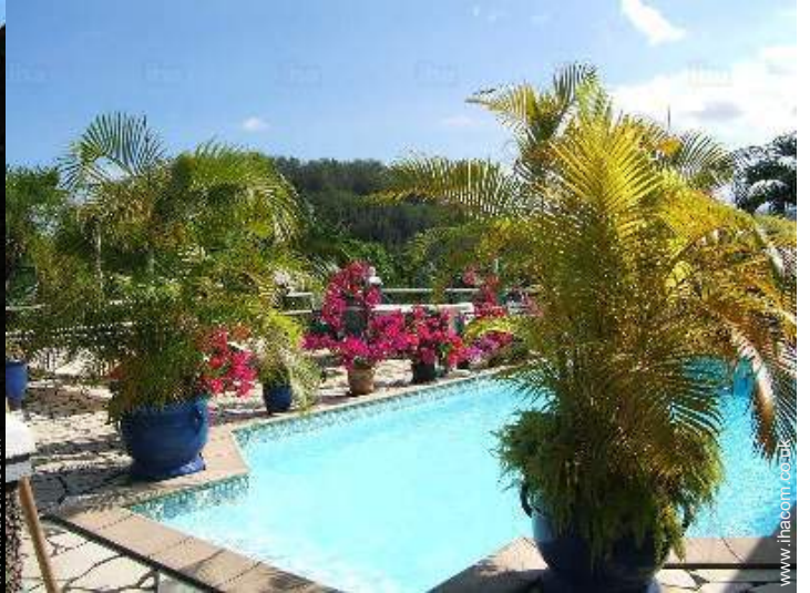
shared swimming pool