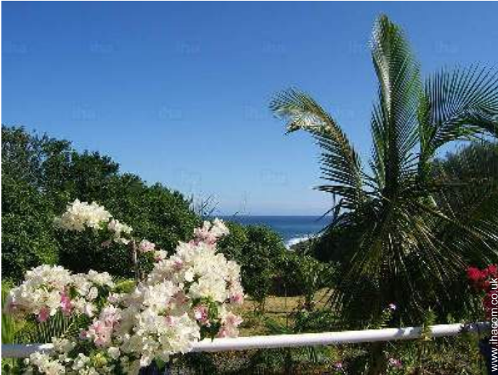
view from the swimming pool