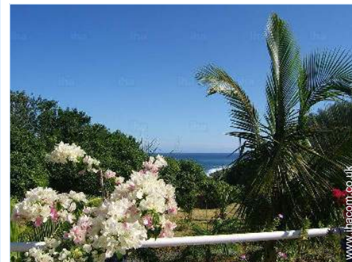
view from the swimming pool

Town centre 0.5mi. Bus stop / bus station 0.5mi. Car rental 990' Breadshop 0.5mi. Local shops 0.3mi. Supermarket 0.5mi. High class retailers 0.62mi. Hairdressing salon 0.3mi. Internet cafe 9mi. Post office 0.62mi. Bank 0.5mi. Cash point 0.62mi. Chemist 0.3mi. Doctor 0.5mi. Hospital 0.5mi.