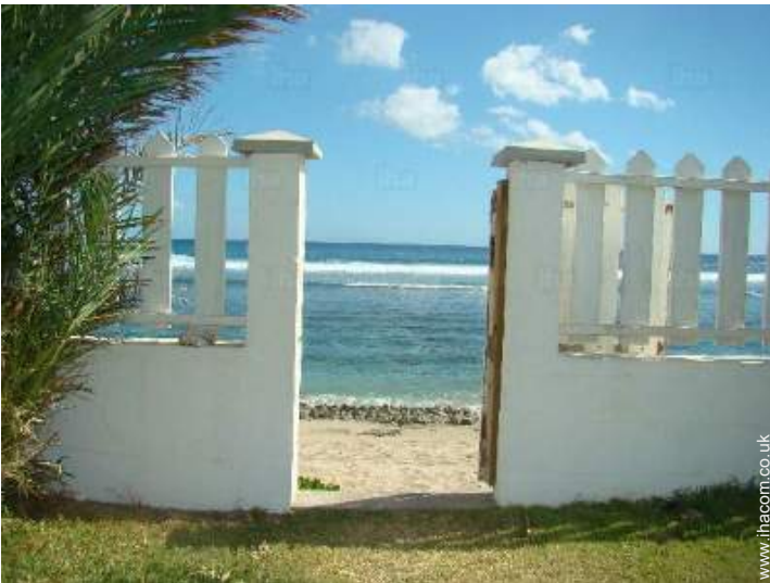
view from the garden/park