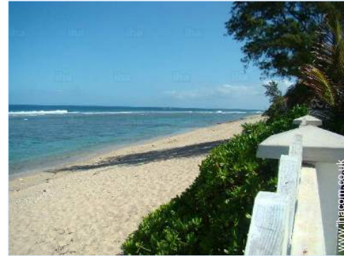
view from the garden/park

BBQ, garden table(s), 8 garden seat(s), parasol, garden seated area, 2 chaise(s) longue(s), 3 sun recliner(s), outside shower facilities, outside toilet facilities