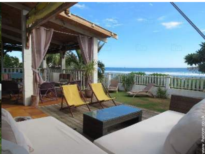
view from the veranda