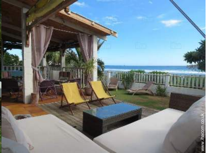
view from the veranda