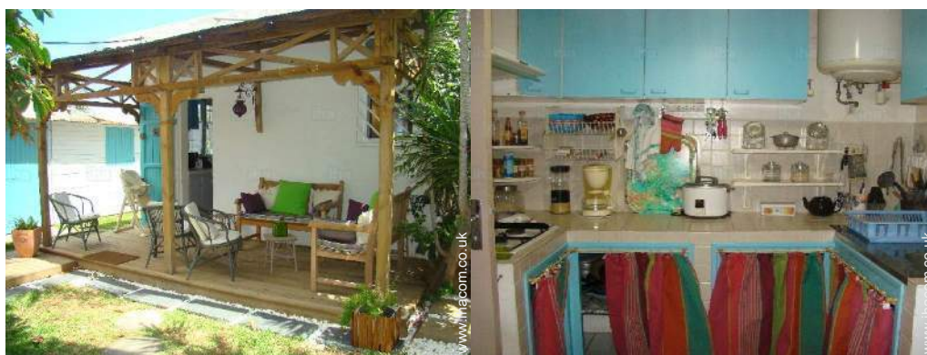
view from the kitchen