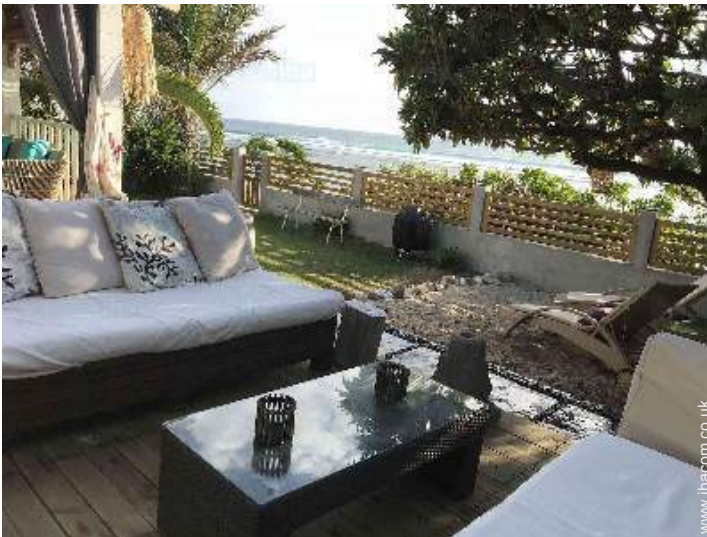
view from the veranda