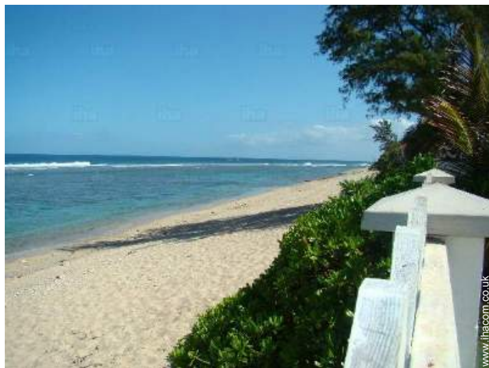
view from the garden/park