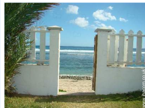
view from the garden/park