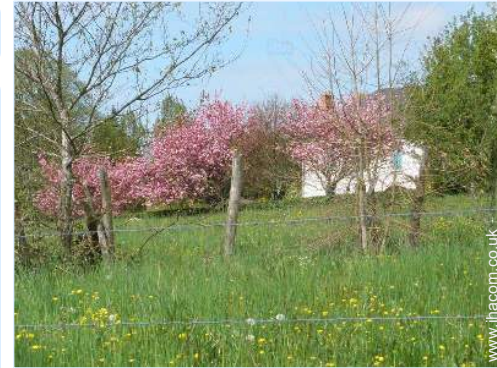
view from the kitchen