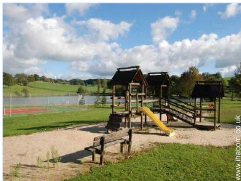
seaside pursuits nearby