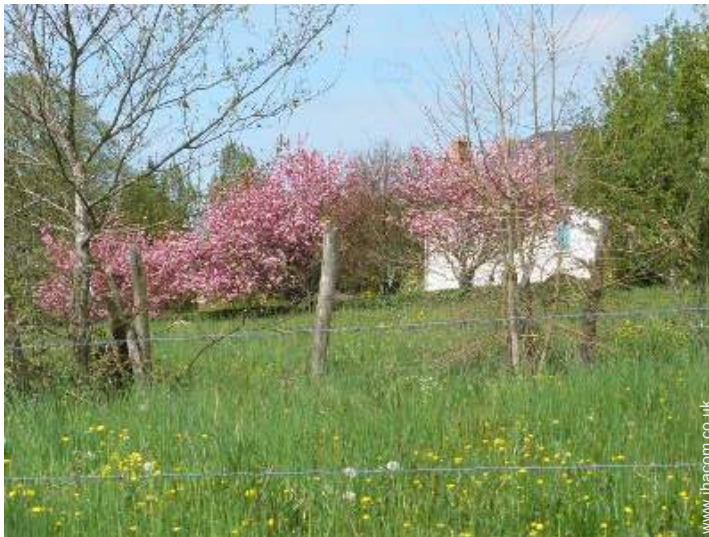
view from the kitchen