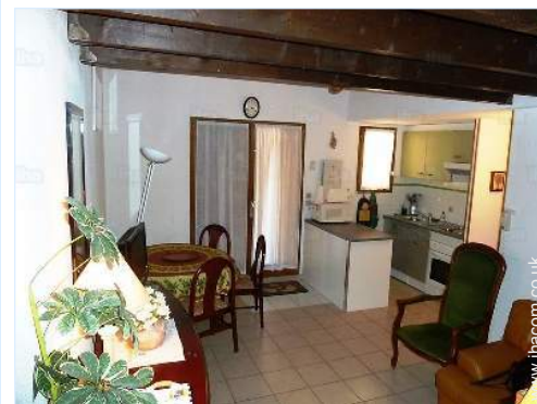
general floor plan

Town centre 990' Bus stop / bus station 990' Boat rental 0.3mi. Breadshop 165' Caterer 0.3mi. Local shops 990' Supermarket 990' High class retailers 0.3mi. Hairdressing salon 660' Post office 0.62mi. Bank 0.3mi. Cash point 0.3mi. Chemist 0.5mi. Doctor 0.5mi. Nurse 0.5mi.