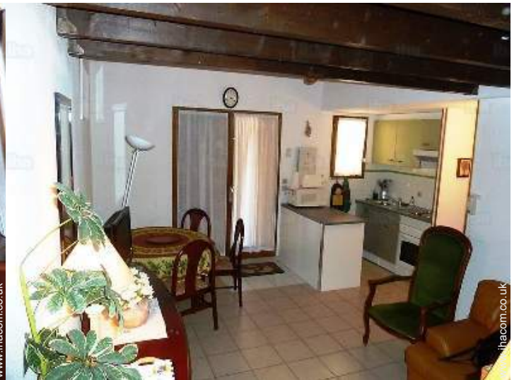
general floor plan