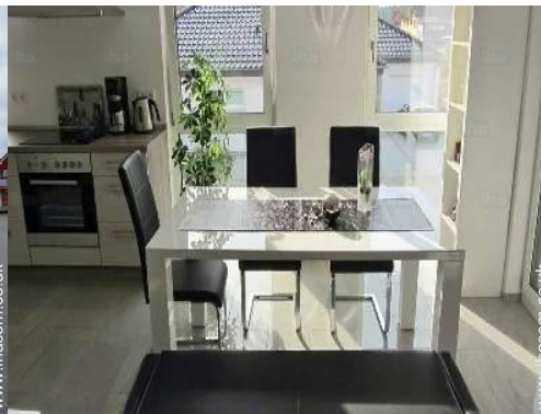
view from the dining-room