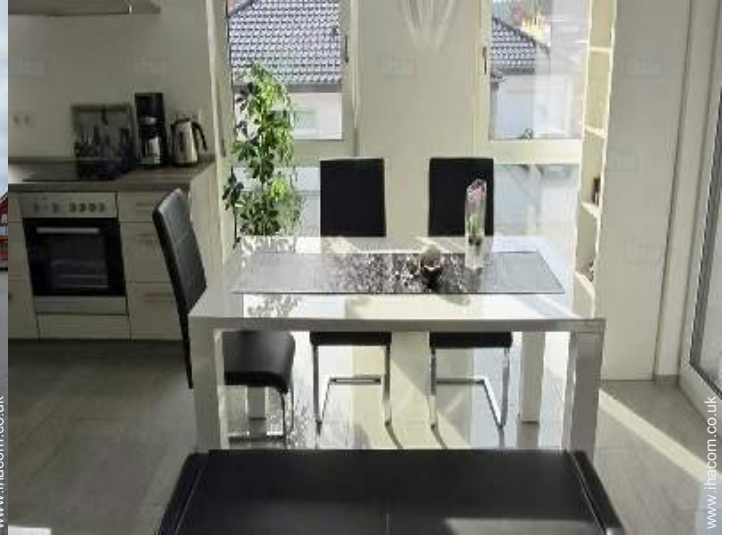
view from the dining-room