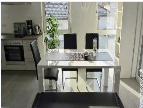
view from the dining-room