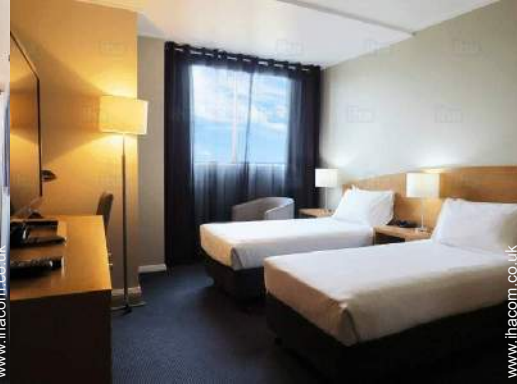
possible extra bed(s)