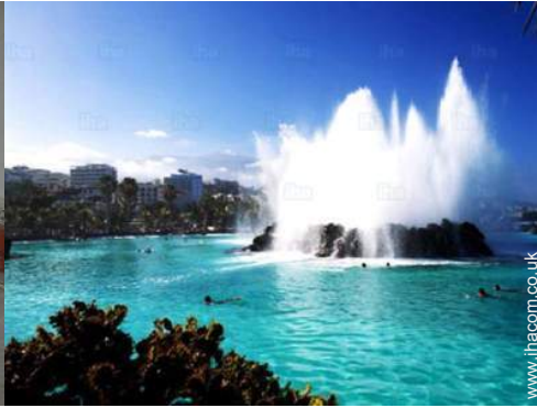
seaside pursuits nearby