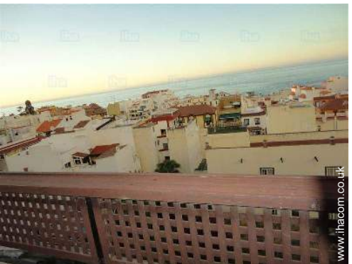
view from the flat