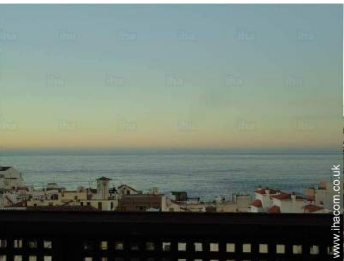
view from the terrace