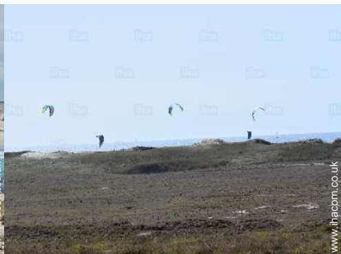
leisure pursuits nearby