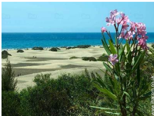
seaside pursuits nearby