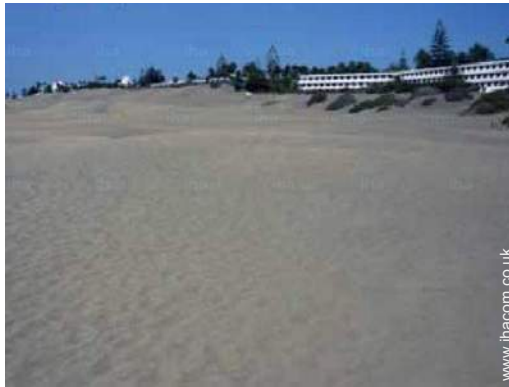
seaside pursuits nearby