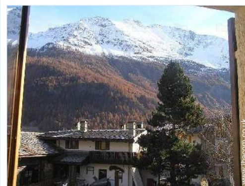
view from the living room

Village centre 990' Bus stop / bus station 660' Bike/mountain bike hire 660' Ski hire shop 330' Breadshop 660' Local shops 330' Supermarket 990' Hairdressing salon 660' Internet cafe 990' Post office 990' Bank 990' Chemist 990' Doctor 660' Dispensing clinic 660'