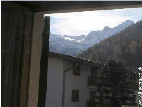
view from the bedroom