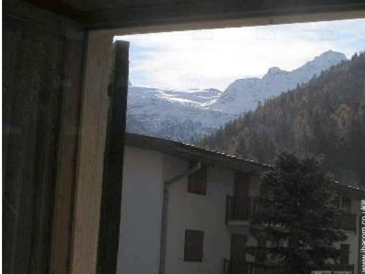
view from the bedroom