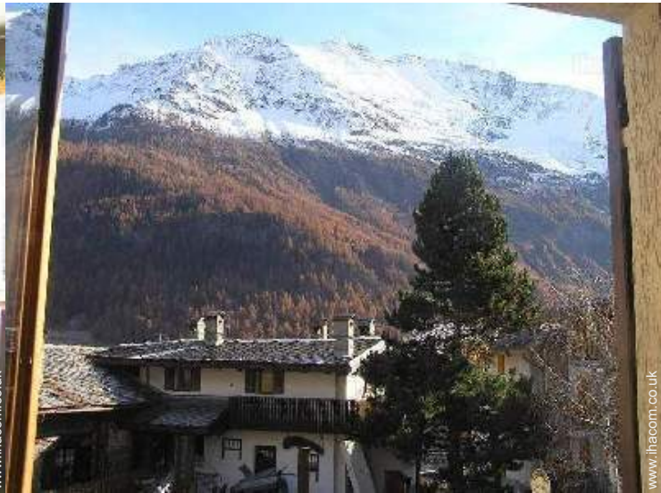
view from the living room