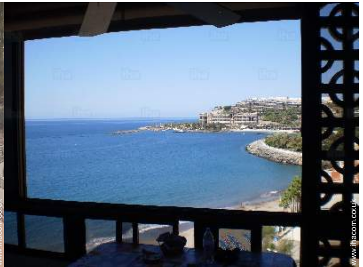
view from the house