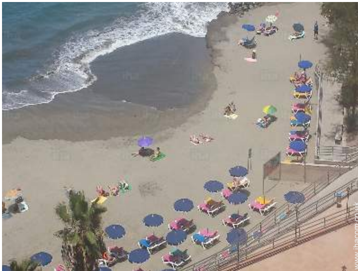
direct access to the beach