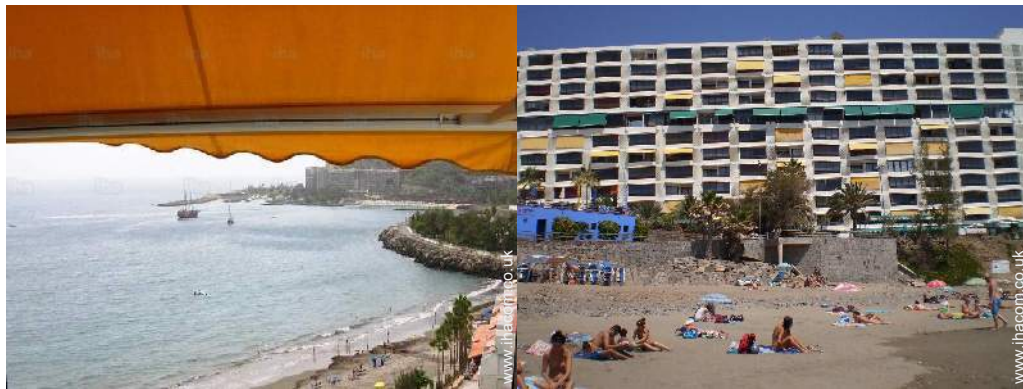
view from the flat