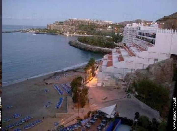
view from the flat