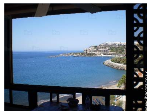
view from the house

Village centre 0.93mi. Bus stop / bus station <165' Car rental <165' Breadshop <165' Supermarket <165' Hairdressing salon <165' Internet cafe 0.93mi. Post office 0.93mi. Bank 0.62mi. Chemist <165' Doctor 0.62mi. Hospital 6mi. Dispensing clinic 0.62mi.