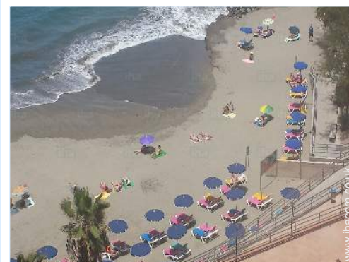
direct access to the beach