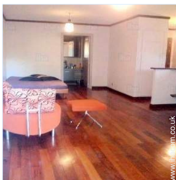
view from the house