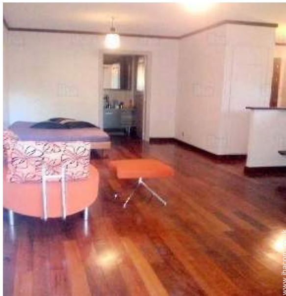
view from the house