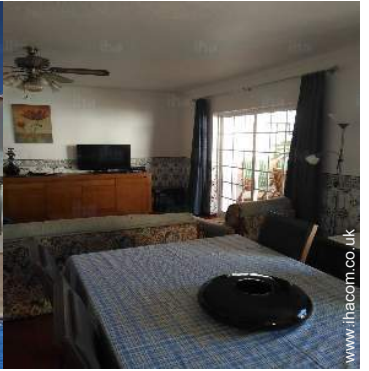
view from the swimming pool