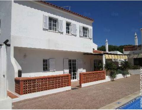
view from the swimming pool