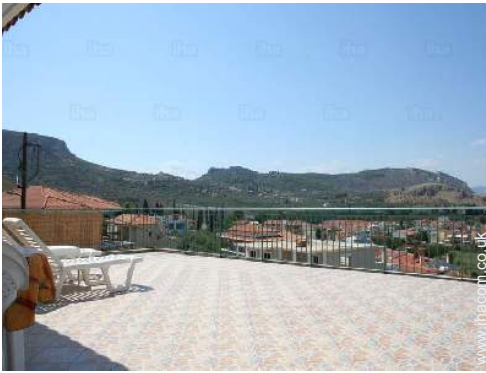
view from the flat