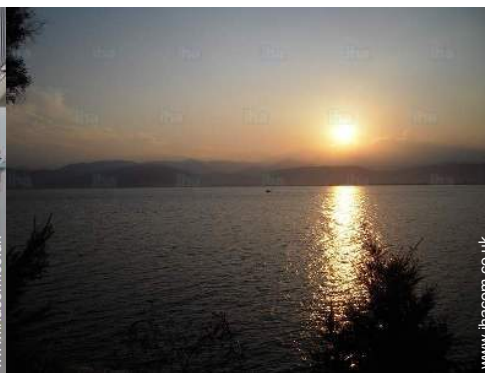
view of the sunset